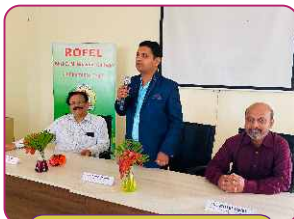
GSPC Sponsored Refresher Course