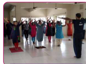
Yoga Day Celebration