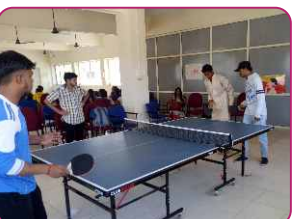
Sports Week Celebration