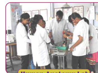
Human Anatomy Lab