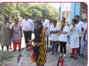
Fire Safety Training