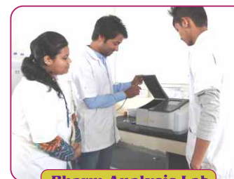
Pharm Analysis Lab