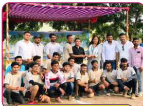
Zone Level Handball Winner