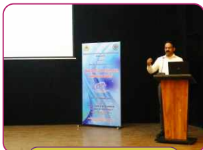
GUJCOST Sponsored Seminar