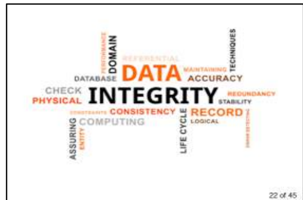
Session Proceedings and content delivery by Tejal Pandey