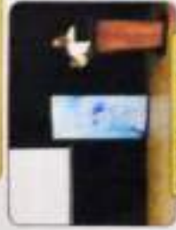
Workshop on New Drugs & Devices