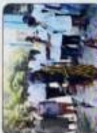
Fire Safety Training