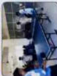
Sports Week Celebration