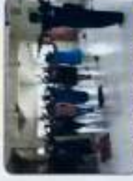
Yoga Day Celebration