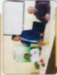
Workshop on Pharmaceutical Quality Control