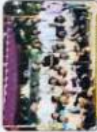
Group Game on Quality of Water