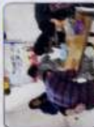
3 Month Meet