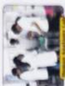
Master Laboratory Lab