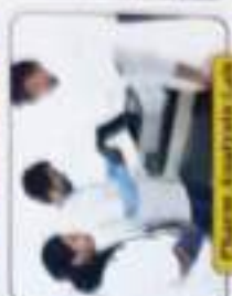
Pharmacy Analytical Lab